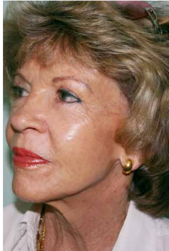
Photodynamic Therapy Before & After - Example 6